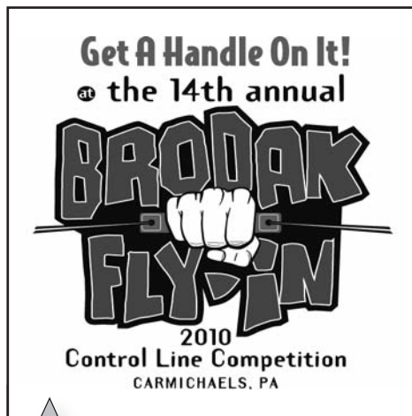
2 nd RICHARD ESSEX Seagull/Nelson 36 • 280.63